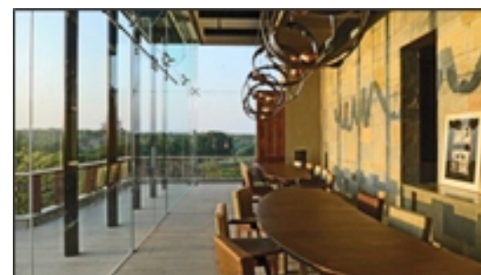
Bridge house, Vadodara, Gujrat.