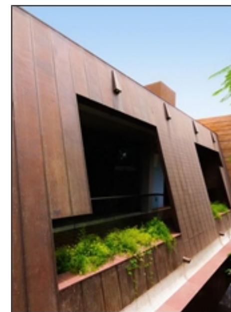
Orchard House, Vadodara, Gujrat