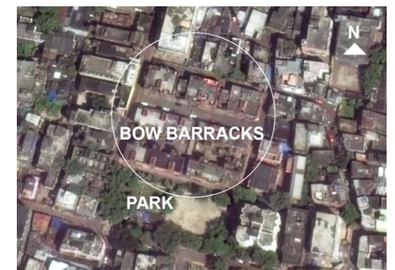
Figure 2. Buildings of Bow Barracks (Google image, 2016)