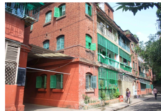
Figure 8. Park- side façade

This planning layout of Bow Barracks is perhaps influenced from or has similarity with old historic Spanish Colonial town plan, for example, of Santo Domingo in Dominican Republic (Fig. 9) established in 1502, where a compact layout having a main 'square' and a city grid layout forms the basic aspects of physical planning (Sendin, 2014). At Bow Barracks, the 'square' is actually a road which is used for all social activities and the buildings