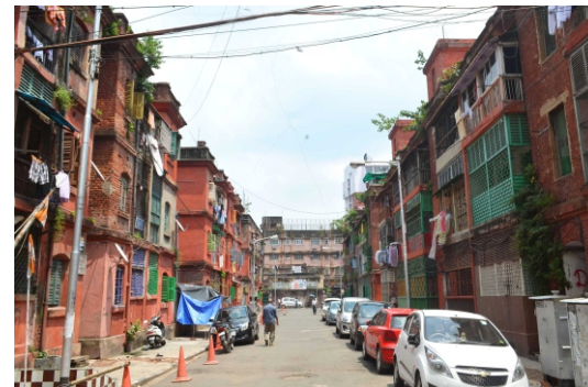
Figure 4. Urban Form and Space of Bow Barracks

There were once a huge number of Anglo-Indians in Kolkata before independence. They suffered from the feeling of identity dilemma for a long time. Neglect from both the British and the native Indians led to their migration to Europe, USA, Canada and Australia after independence (Cassity, 2014). A lot of them