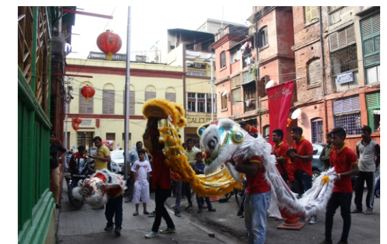
Figure 6. Celebration of Chinese New Year in Bow Barracks

The barracks built as Garrisons' Mess suggesting that there would be simplicity in its architecture. The field work reveals that seven three-storied blocks were constructed on two pieces of plots comprising in total 4055 sqm with a 12 m (40 ft) wide road in between the plots (Fig. 3). The northern plot with area 1535 sq m linearly contains three identical building-blocks connected by two service-core offering