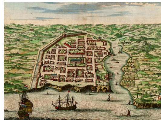
Figure 9. Plan of Santo Domingo, Dominican Republic

are linearly positioned along the other roads in grid format. All the seven blocks having the same style and colour as a whole reflect unity, symmetry and balance in the design of the place. The small open spaces in between the blocks give opportunity for doing household activities, vehicle parking and worshipping especially at the demarcated 'grotto' (Fig. 10).