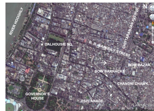
Figure 1. Location of Bow Barracks at CBD in Kolkata

Improvement Trust (CIT, now KIT formed in 1912) with the construction of a barrack (Garrison's mess) on a plot comprising a park on Bow Street ( Fig.1 ) near the Dalhousie Square Central Business District (CBD) zone (Nair, 1985). The KIT cleared off trees and junks from the northern side of the park and built a three-storied housing there ( Fig. 2 ) for the soldiers in 1918 keeping a park area only on the southern side (Nair, 1985) and creating a road dividing the plot into two plots with the Barracks' buildings ( Fig. 3 & 4 ). Quickly after the War stopped, the soldiers departed from this place and the administration handed over the housing settlement to the KIT. At that time, KIT was widening the present Chitta Ranjan Avenue through its Scheme No. VII D (comprising Central Avenue, Bow Bazar and Prinsep Street region) for which, many Anglo-Indians of Tirreta Bazar were displaced. KIT gave them accommodation at this housing settlement on rental basis during 1919-1920 (Roy, 2008). Presently, the settlement includes families of Anglo Indian, Anglo Chinese, Muslim, Hindu Bengali and Gujarati communities.