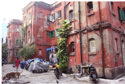
Figure 12. Damaged walls with vegetative growth

The toilet-side walls are also damaged from leakage of water from iron-made drainage pipes and vegetative growth on their joints and immediate walls (Fig. 12). A few residents have done repairing like roof insulation, plastering, floor finish, etc, in their individual flats. However, overall physical conditions of the buildings are not very bad, though they require