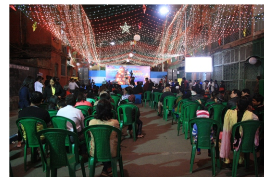
Figure 5. Christmas Celebration at Bow Barracks

Barracks celebrate their religious festivals on their own within their apartments only. However, the Anglo-Indians of Bow Barracks have a rich culture and tradition of celebrating Christmas in an extravagant way that extends from December 24 up to January 01 of the following New Year on the wide road in between two rows of the building blocks (Fig. 5) and attracts people of Kolkata and foreign tourists at this place. Chinese New Year is also celebrated here every year by the Anglo Chinese and Chinese Indian people residing here and at nearby areas such as Teritta Bazar. Dragon dance by the youth during the festival (Fig. 6) is a very interesting and landmark socio-cultural event.