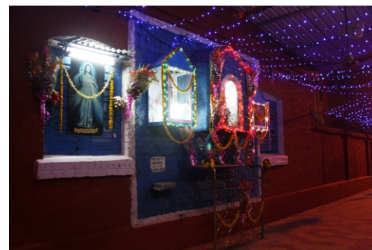
Figure 10. Prayer Grotto