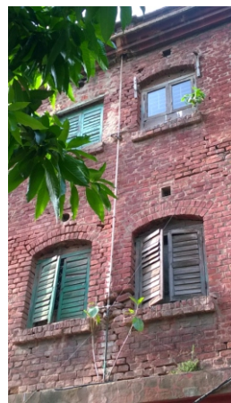
Figure 11. Change in windows

architectural character of the buildings are retained, some minor modifications and changes are visible. For example, galvanized iron or fibre corrugated sheets or burnt clay tiles have been added as roofing over the balcony to give some protection of the interior from invasion of rain during monsoon. Some portions of the exterior walls that originally had exposed-bricks skin are seen having plastered and painted in red colour. Some