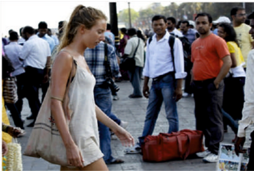
Figure 1: A German Tourist at Gateway of India, Mumbai, India.

"Women's experiences of city life are affected by gender-based discrimination and abuse in public and private space, including exclusion from political and socio-economic participation, limited access to essential services and infrastructure." (The Delhi Declaration on Women's Safety, Government of India, 2013) .