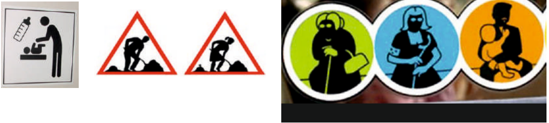
Figure 4: Attempts towards gender mainstreaming by changing society's mindset through signage in Vienna