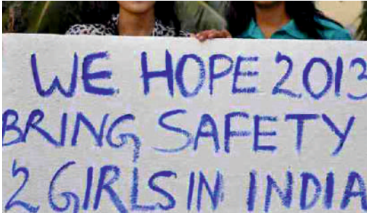
Figure 7: Banner questioning women's safety in India (Source: instablogs.com, 2013)