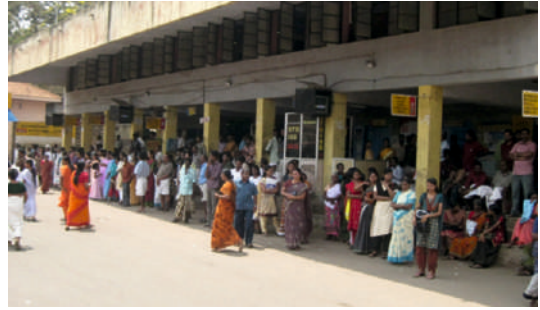
Figure 8: Bus stand at Cochin, Kerala flooded with female travellers

still a woman's responsibility in the Indian context.