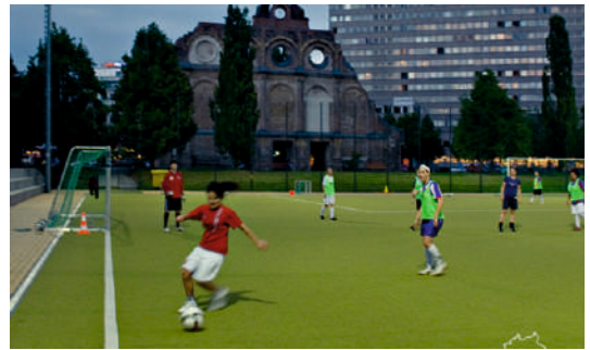
Figure 5,6: Gender mainstreaming in spatial planning, Berlin

India with its own different socio-cultural background needs to follow these footsteps towards women friendly city planning for its all inclusive development.