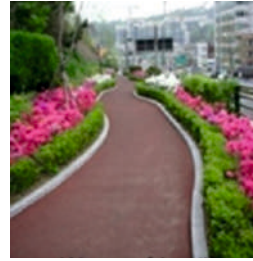
Figure 3.3: Women-friendly sidewalks