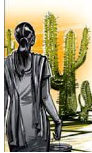
Figure 10: Inadequate public toilets make women vulnerable and expose them to risks

JNNURM (Jawaharlal Nehru National Urban Renewal Mission) dealing with reform and good governance suggests guidelines for gender mainstreaming into planning and decision making process, transportation and crime prevention through environmental design.