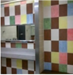
Figure 3.1: Women-friendly restrooms