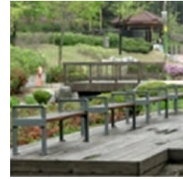
Figure 3.4: Women-friendly parks restrooms