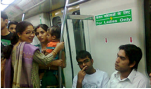
Figure 9: Women-only metro compartment used by men