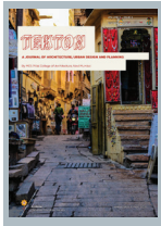
Volume 2, Issue 2 No. of copies: