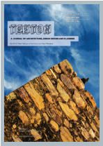
Volume 3, Issue 2 No. of copies: