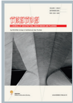
Volume 1, Issue 1 No. of copies: