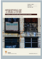
Volume 2, Issue 1 No. of copies: