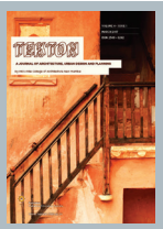
Volume 4, Issue 1 No. of copies: