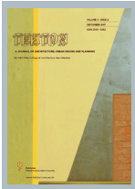
Volume 4, Issue 2 No. of copies:

We place an order for _____ no. of copies as indicated above at the rate of _____ We enclose a Check/ DD no.(payable at Navi Mumbai) _____, dated ___/___/_____, Amount _____, Bank _____